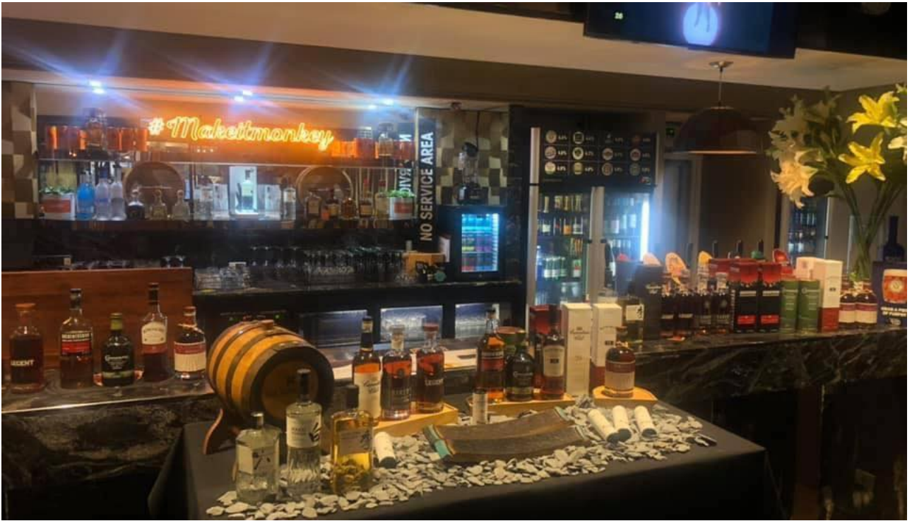
Kingsway City Shopping Centre