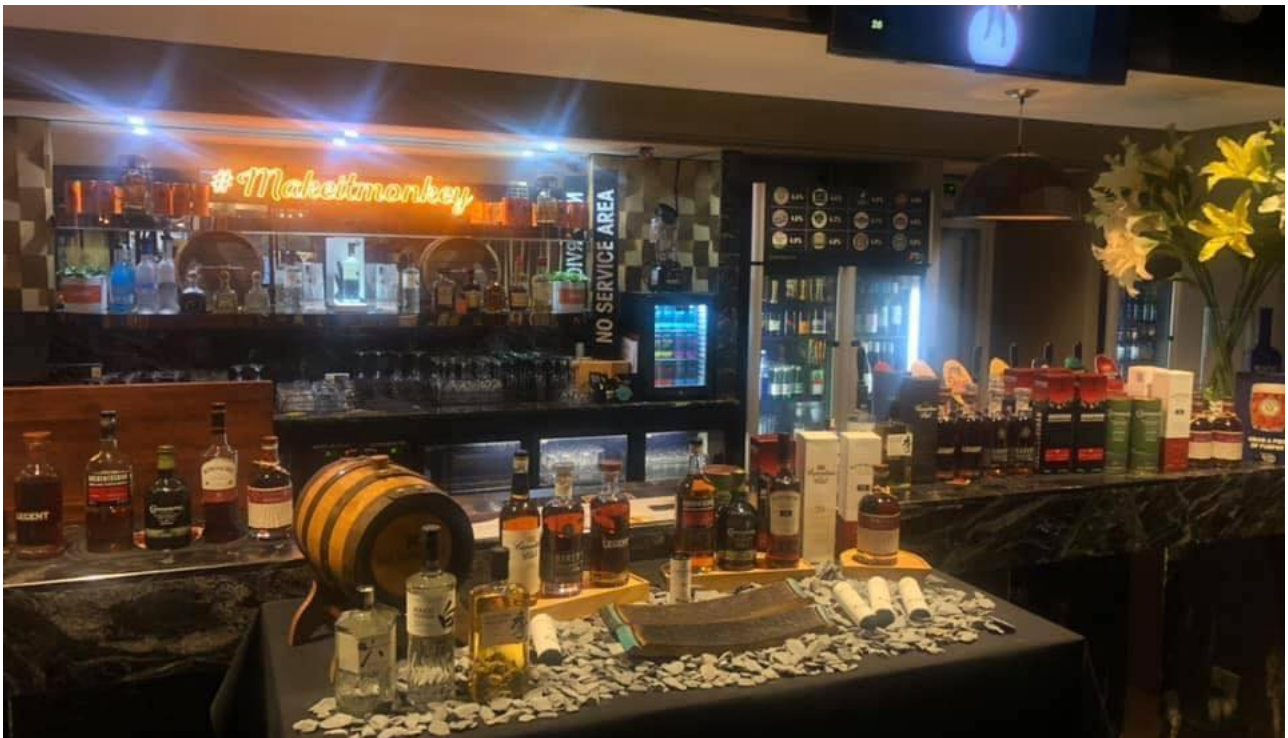
Kingsway City Shopping Centre